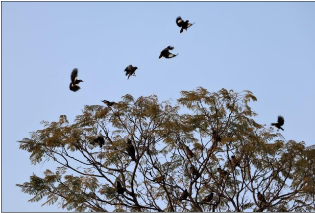
Fig 2: A flock of common myna making attempt to drive of an individual of common crow (sitting on a twig near carcass).