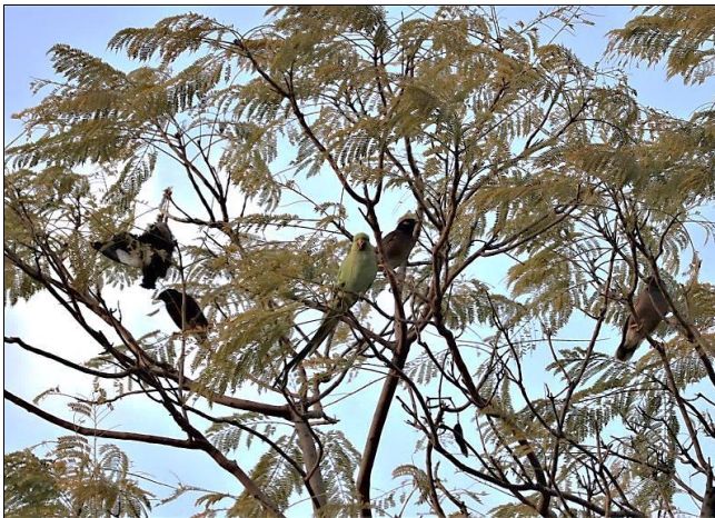
Fig 3: An individual of rose-ringed parakeet near carcass.

The incident went on for a longer duration and we kept watching the incident until it was a little dark. While examining the cause, it appeared that one of the legs of the bird was entangled with the string and somehow the bird was hanged in one of the thin twig of the tree. A piece of dark grey string was observed hanging from the tree, touching the ground. Regular attempts by the house crow for snatching the carcass and chasing them away by the common myna reveals on the interspecific aggression between species. Although, common mynas are social birds that roost communally, the incident reveals on a typical social behaviour and response of the species. Understanding the consequences of losing individuals from wild populations is a current and pressing issue, yet how such loss influences the social behaviour of the remaining animals is largely unexplored (Firth et al. 2017) [3] .