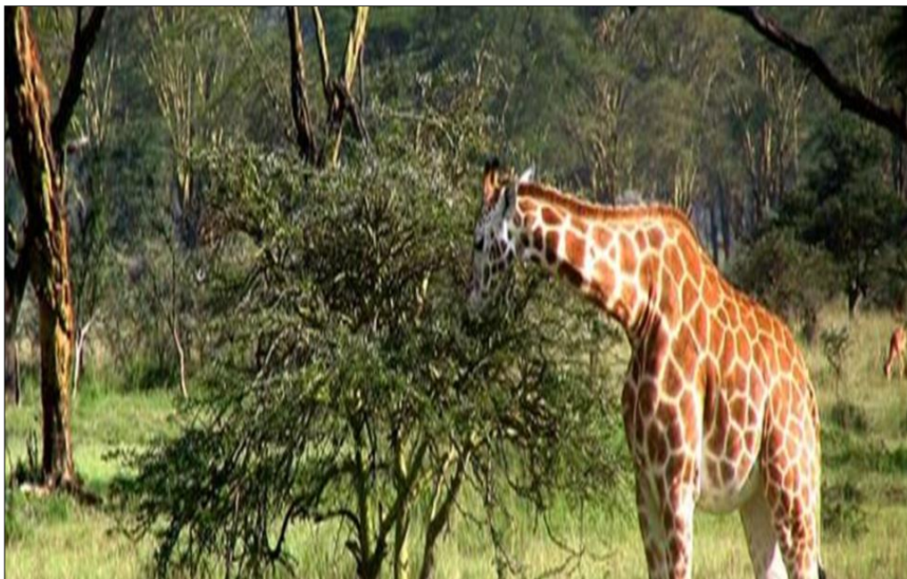
Fig 1: Checklist of Forage Plant Species Consumed by Giraffes in the Wet and Dry

(ii) The figure under every season represent the relative density of each forage.