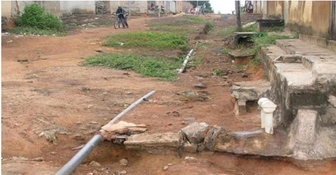
July 2019