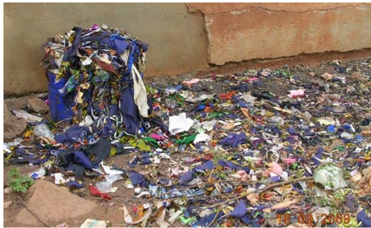
July 2019