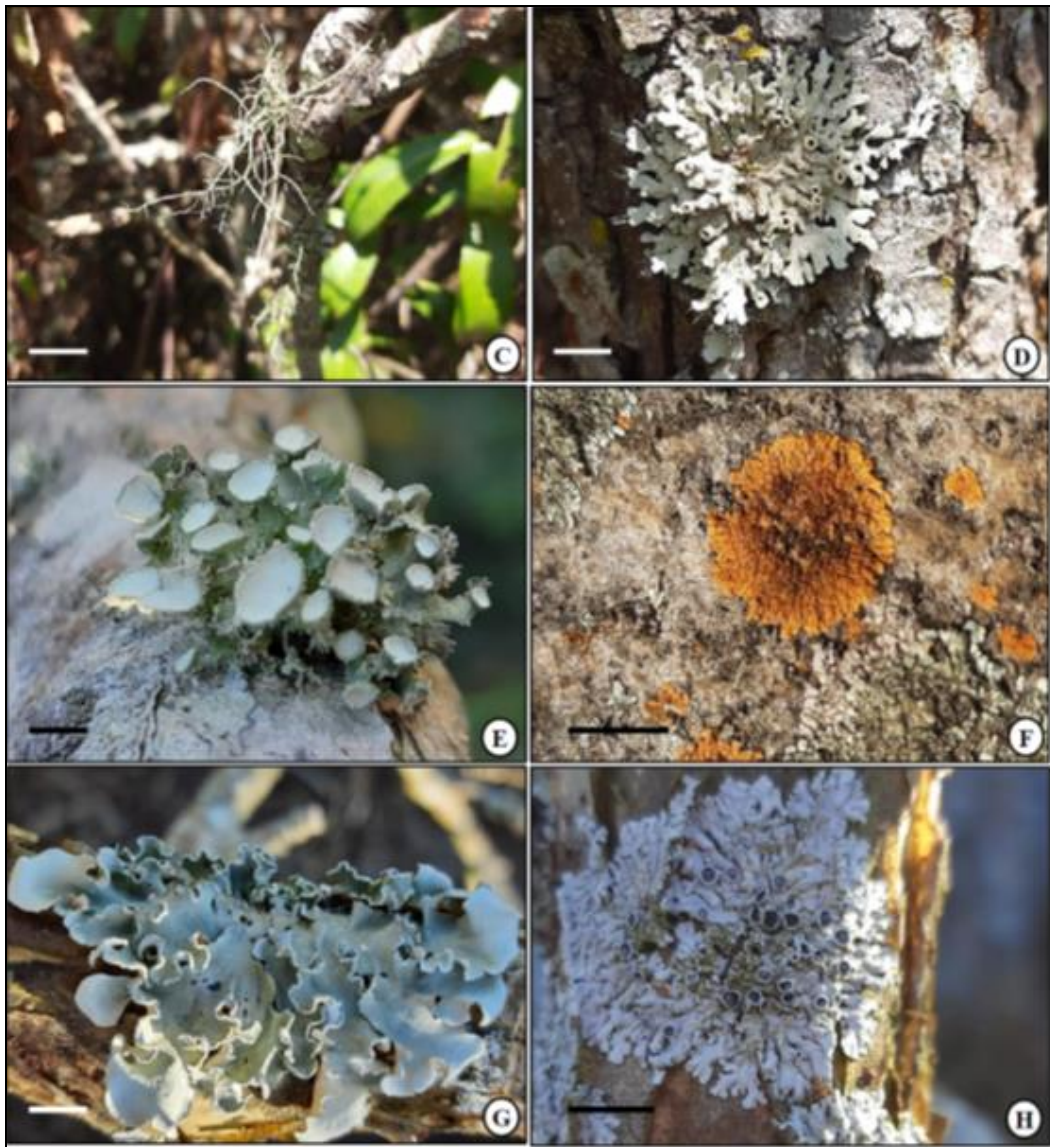
Fig 1: Lichen Distribution in this study. A. Parmotrema arnoldii , B. Parmotrema perforatum , C. usnea Pectinata D. Parmeliopsis hyperota , E. Ramalina pacifica , F. Caloplaca bolacina , G. Parmotrema austrosinense , H. Physcia aiolia . (Scale bar = 1cm)